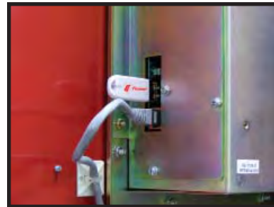
USB Host Port and Flash Disk

The controller is equipped with a built-in USB Host Controller. A USB port capable of accepting a USB Flash Memory Disk is provided. The controller saves all operational and alarm events to the flash memory on a daily basis. Each saved event is time and date stamped. The total amount of historical data saved depends on the size of the flash disk utilized. The operator can save settings and values to the flash disk on demand via the user interface.