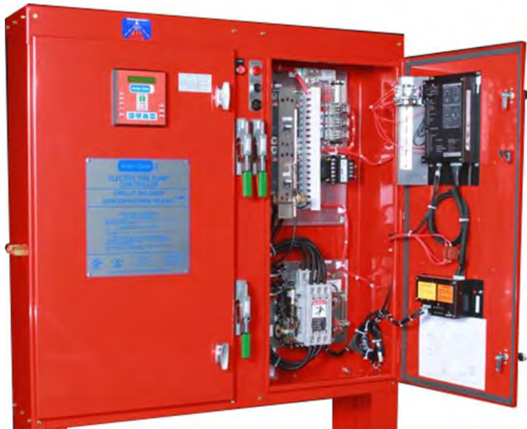
Transfer Switch Controller

Fire Pump Controllers with Automatic Transfer Switches provide for power connections to the fire pump motor from the primary power source or an alternate emergency generator. If the primary power supply fails, an automatic transfer is made to the emergency supply. Automatic retransfer to normal power supply will occur after restoration of normal power.